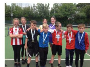
Year 5 Tennis Festival